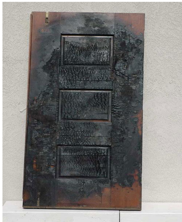
Figure 2: Burned doors of Baghdad by Mohammad Al-Saadoun (Iraq) (2009)