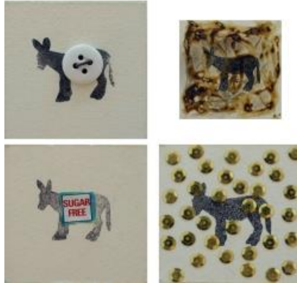
Figure 3: A Donkey made in Palestine by Ashraf Fawakhri (Palestine) (2017)