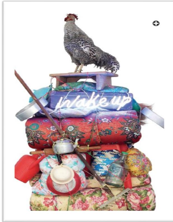
Figure 1: Wake up by Ayman Balbaki (Lebanon) (2012)