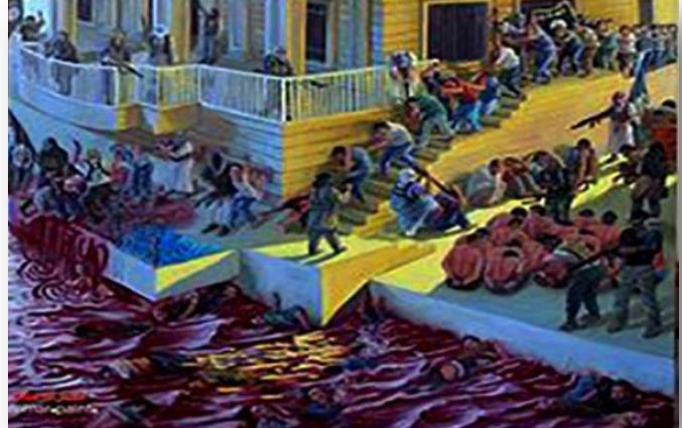
Fig.2: Spyker Massacre in Salah al-Din Governorate

Location: Camp Spyker in Salah al-Din Governorate