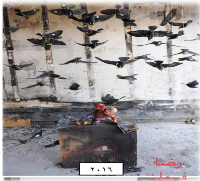
Fig.5: Childhood form Artist's own collection

As shown in Figure 5, the artist illustrates through this work the childhood and the dangers surrounding him to express a contradiction in the renaissance thought, as he was deprived of his responsibility for himself and his freedom of choice. In fact, this is one of the main ideas that embodied terrorism in its worst form, using children by the aforementioned groups, which makes them victims in many ways, as they can be used to commit acts of a criminal nature and the effects that may result from that, which may lead to the loss of their lives and the lives of others. The innocent, in addition to the physical and psychological harm that may be inflicted on them.