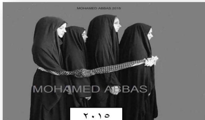
Fig.3: Prisoners for private artist collection

As shown in Figure 3, the work demonstrates placing the recipient in a cognitive environment in which the cognitive standard is deviated, to generate a very bad psychological connotation or effect. The artist's style stems from self-thoughts that carried the influences of a society that believes that women are prisoners to him and that he practices all illegal things on her. This work represents violence against