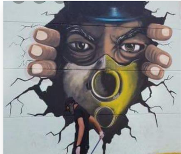
Fig.1: Live drawing for the wall of Al-Tahrir square

As shown in Figure 1, the artistic painting illustrates a group of vocabulary: the search for freedom, the struggle against terrorism and the fight against terrorism in all its forms. The artist was able to clarify hidden worlds that lie in the automaticity that allows suggesting aesthetics that bear several connotations, as the deaf walls turned into vivid paintings that simulate the human being and utter what he feels and hopes and seeks to reach peace.