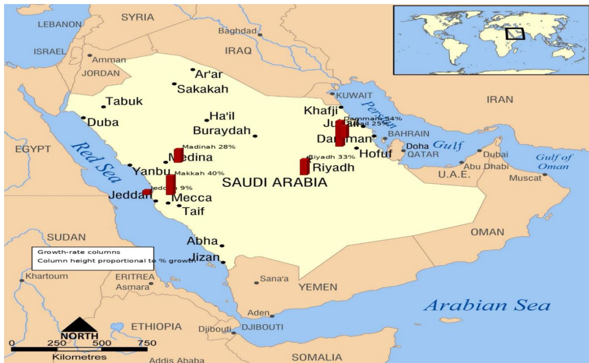
Figure 3. Urban growth rates of major Saudi cities using proportional circle representation (2010–2022).

Dammam recorded the highest growth rate during the study period. This reflects the concentration of industrial and energy-related activities in the Eastern Province. The expansion of industrial and energy-related activities in the Eastern Province has contributed significantly to population growth in this region. Makkah also experienced strong demographic expansion due to the development of pilgrimage infrastructure and tourism-related services.