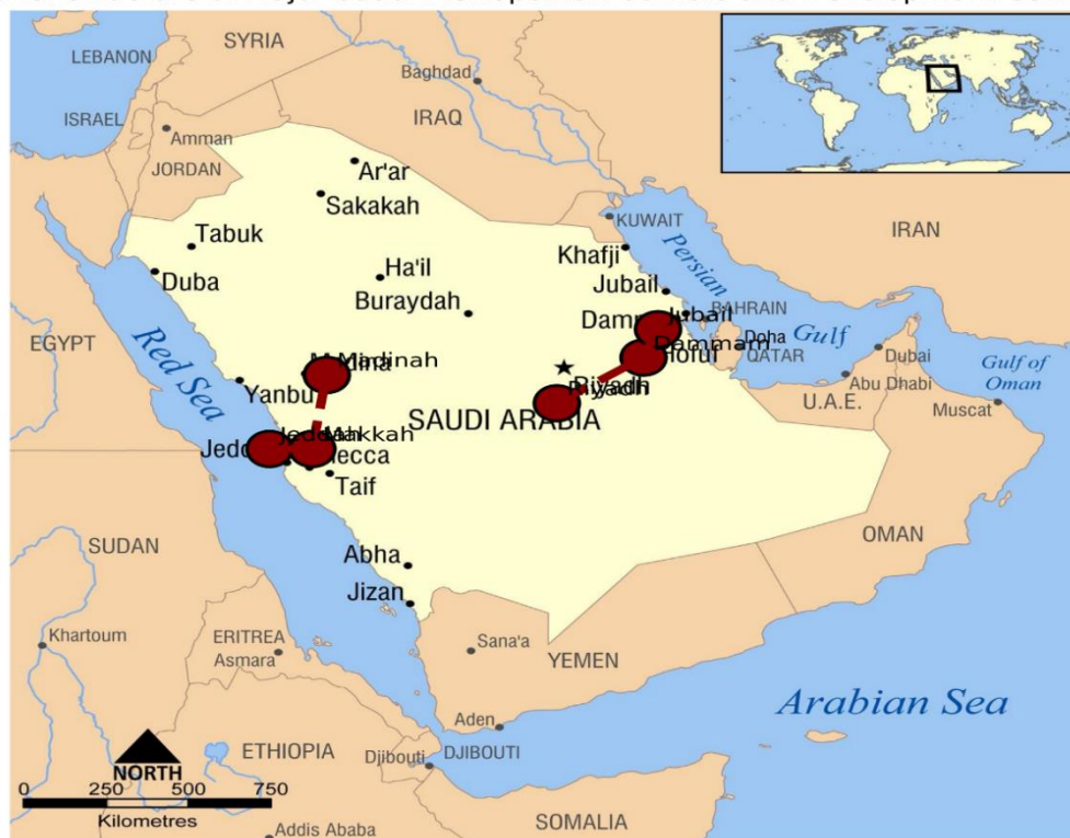
Figure 4. Spatial structure of major Saudi metropolitan centers and development corridors

The spatial structure of the Saudi urban system is characterized by a set of dominant metropolitan centers connected through major development corridors. The western corridor linking Jeddah, Makkah, and Madinah reflects the religious and service-oriented urban axis, whereas the eastern corridor connecting Riyadh, Dammam, and Jubail highlights the industrial and economic axis of the Kingdom. This spatial configuration is illustrated in Figure 4.